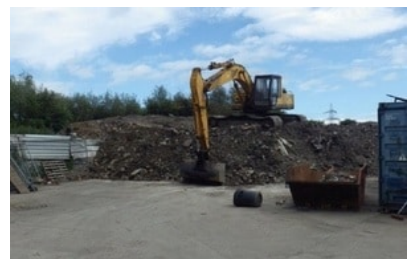
Waste at the Hope Street compound

On July 31 EA officers attended land nearby and saw smoke coming from the compound. They attended on August 4, but found no reduction in the waste pile.