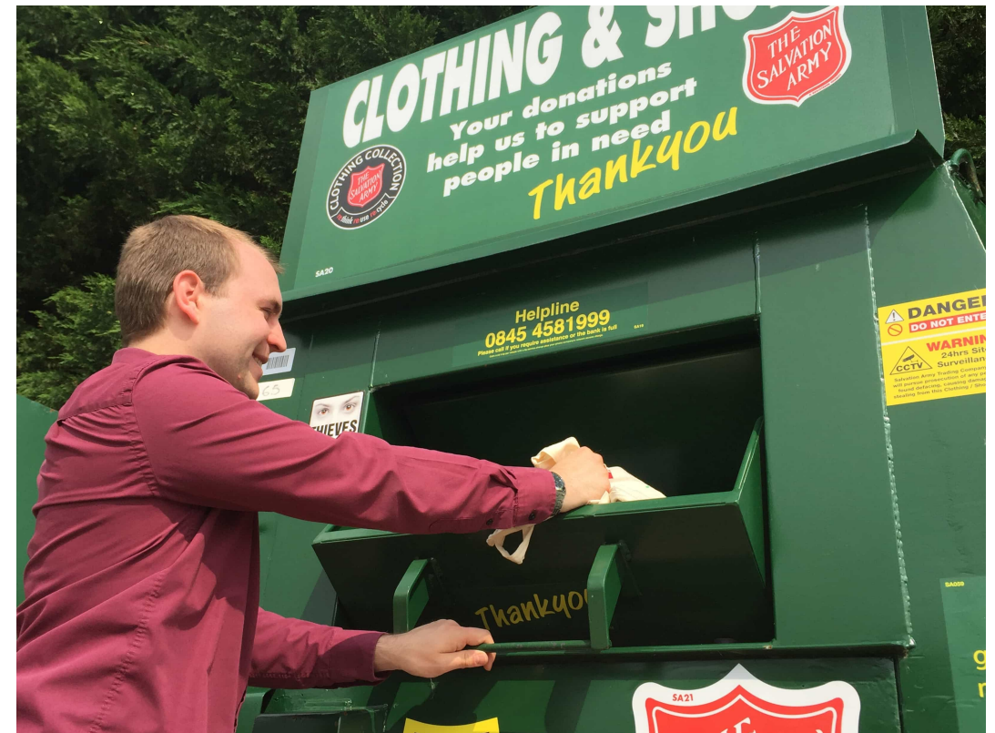
Campus Living Villages set up the scheme alongside the Salvation Army